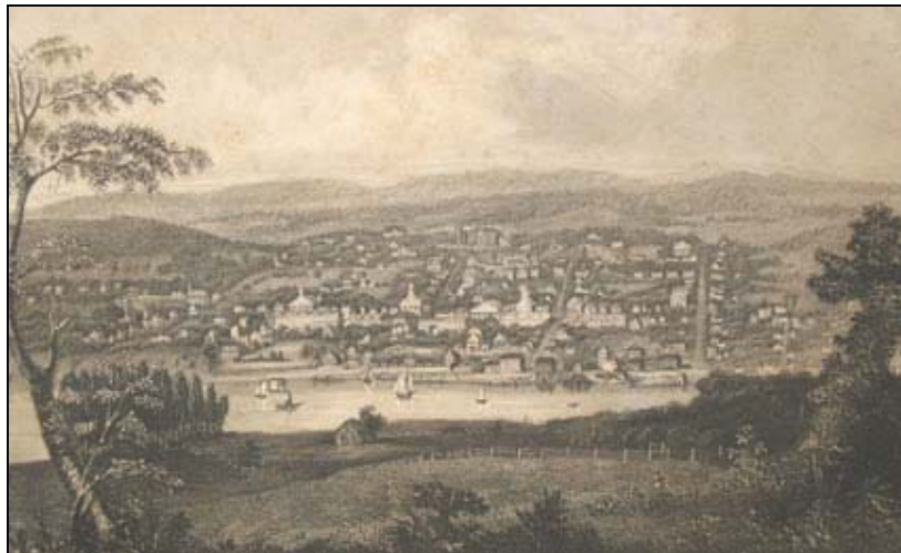
View of Middletown, Conn., c1850, with Connecticut River in foreground.

NERGC 2007 will be in Hartford at the new Connecticut Convention Center and Hartford Marriott Downtown, just off I-91, overlooking the Connecticut River.