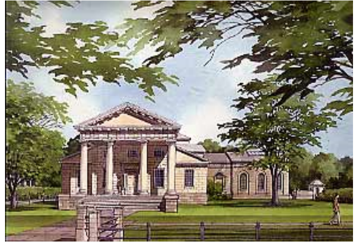
The completed restoration and renewal project, as depicted here in an architect's rendering, will restore and beautify the Redwood without compromising or altering its historic or architectural integrity. Much of the new addition will be below ground. The project was designed by the Boston architectural firm of Shepley, Bulfinch, Richardson and Abbott.