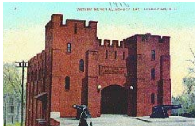
Varnum Armory, East Greenwich, RI, will be the venue for the RIGS members meeting on September 17, as well as a program topic. The Varnum Continentals built their Armory in 1913 in the medieval architectural style. The armory is listed on the National Register of Historic Places. A 1984 State Historical Building Survey described the Varnum Memorial Armory as remaining in perfect original condition. A tour of the Armory will be available to those interested.

Greene Homestead in Coventry, will speak on the Greene family. We will break up into groups based on the various Greene families for the purpose of sharing information and trying to break down some of the brick walls our members have run up against while researching this old RI family. 📍