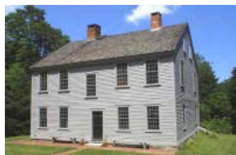
Nathaniel Greene Homestead, Coventry

1:15 pm Research: Greene Family. This meeting is part of our series featuring RI families. We will be featuring the Greene family and ask that everyone bring charts, books, papers and especially their brick walls.