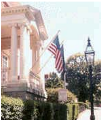
Newport Historical Society, Touro Street, Newport.