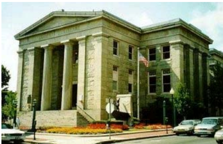
Visit the New Bedford Free Public Library at 613 Pleasant Street, New Bedford, MA

Note that the Genealogy Department & Archives has limited hours: 1:00pm -5:00pm on Tuesday/Wednesday/Thursday, 6:00pm -9:00pm on Tuesday evenings, and 9:00am-5:00pm on Saturday. Access to the archives collection is by appointment only, so call ahead at (508)961-3104 or email pcyr@sailsinc.org . The library is located at 613 Pleasant Street, New Bedford ▲