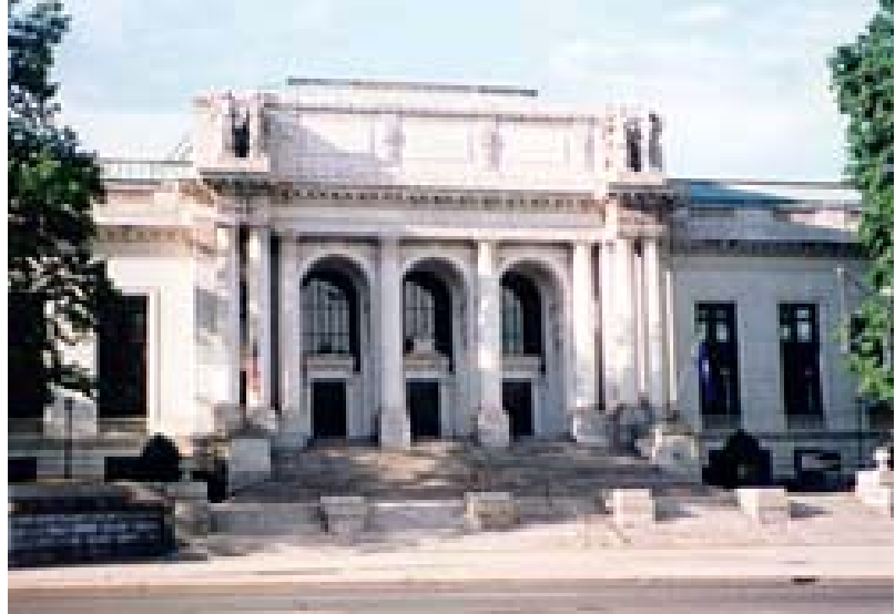
The Connecticut State Library in Hartford will be the destination for the next RIGS research bus trip, Wednesday, March 15.