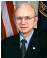
Allen Weinstein Archivist of the United States