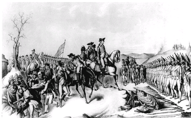
Hessian Troops surrendering after the battle of Trenton