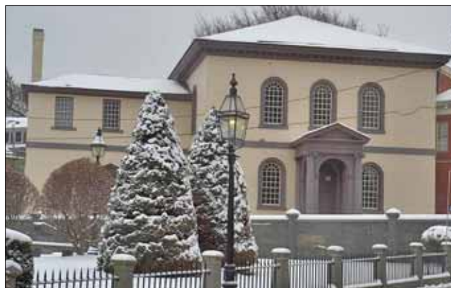
The Touro Synagogue